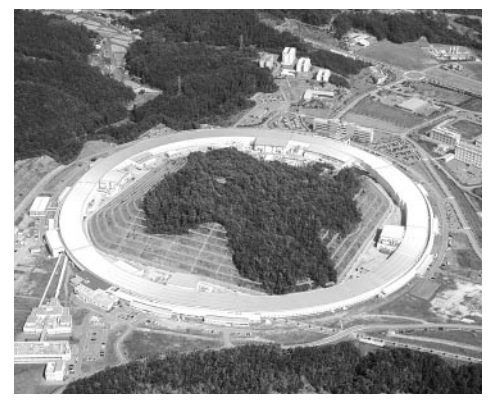
Presented by: Japan Synchrotron Radiation Research Institute

First, with regard to the XAFS (X-ray Absorption Fine Structure) system which is widely used by industry, we will establish a beamline purely for this application. Also, since many companies at this time are conducting research on an independent basis, there is a lot of similar research going on without collaboration, leading to inefficiencies. So in order to facilitate more efficient use of the beamlines, basic research to develop solu-