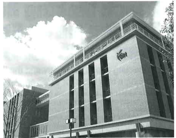
Institute of Biomedical Research and Innovation (IBRI)

The concept of Kobe becoming a Medical Industrial City began in 1999. Since then, focusing on the second stage of Port Island, Kobe has continued to develop into a life science 'super cluster' combining the industrial, academic and government sectors. Now after 8 years, more than 100 advanced companies have moved into the area. With its high grade infrastructure, Kobe is moving towards the realization of its goal of 'activating the Kobe economy, and improving the medical service standards and general health and welfare of citizens'.